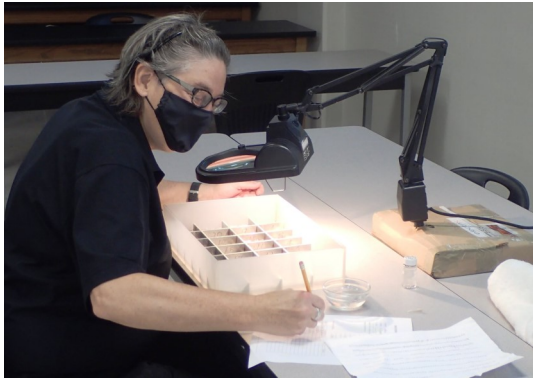
Above left: A volunteer picks through a bug sample that was collected over the summer and records her findings.

diversity of species suggests that the stream has everything necessary to support a variety of macroinvertebrates, including adequate water quality, food sources, living spaces and conditions that allow for reproduction.