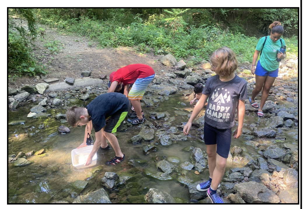
Students from Riverfield Country Day School in Tulsa join Blue Thumb staff for a stream ecology lesson in the Mooser Creek watershed. Friends of Blue Thumb supports activities that bring people outside—right to the banks of the stream and even into the water. These children will understand that this small stream, which is clean and filled with interesting creatures, will flow into a larger stream and eventually into a lake that is used for drinking water.

You can be part of this good work by making a contribution to FBT. Information about how to do this is below. You can also contact us about how YOU can make changes, starting in your own yard.