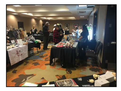
Craft items, clothes, and food, were part of the inventory to be purchased, and photo opportunities were everywhere. Water quality information and how to get involved in Friends of Blue Thumb was also shared.

Friends of Blue Thumb meets six times annually with a call-in meeting (since Covid). FBT has no paid staff. We are a team of committed people who believe in protecting the streams, rivers and lakes in Oklahoma primarily through support of Blue Thumb Water Quality Program volunteers. Learn more about these volunteers and the other good work happening as a result of the Blue Thumb Program at: