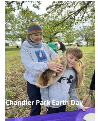
Chandler Park Earth Day