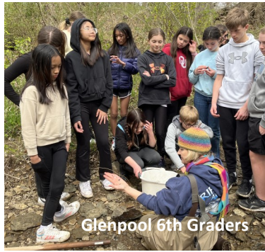
Glenpool 6th Graders