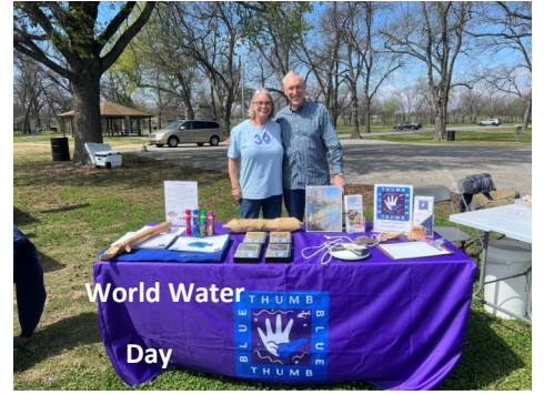
World Water Day