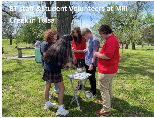
BT staff & Student Volunteers at Mill Creek in Tulsa