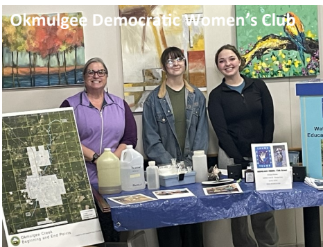
Okmulgee Democratic Women's Club