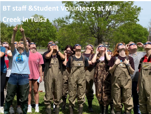
BT staff & Student Volunteers at Mill Creek in Tulsa