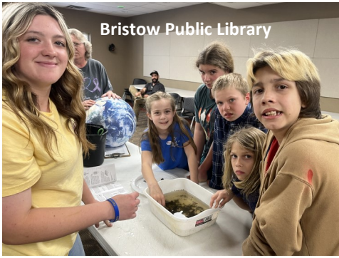
Bristow Public Library