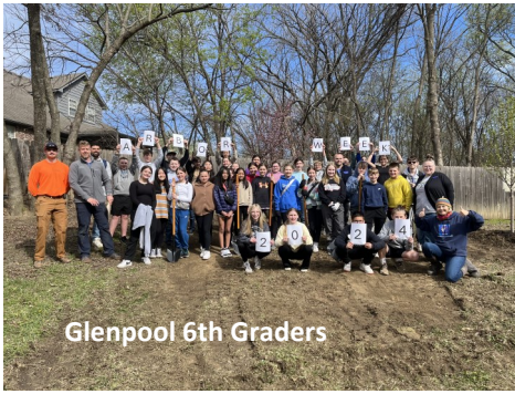
Glenpool 6th Graders