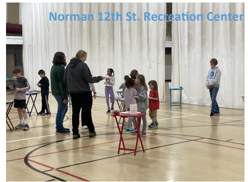
Norman 12th St. Recreation Center