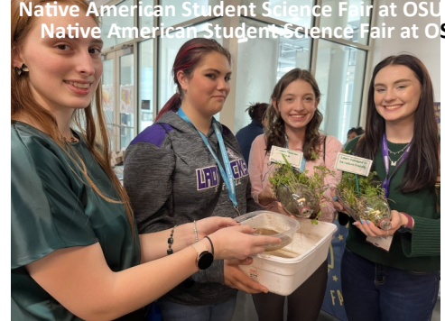
Native American Student Science Fair at OSU Native American Student Science Fair at OSU