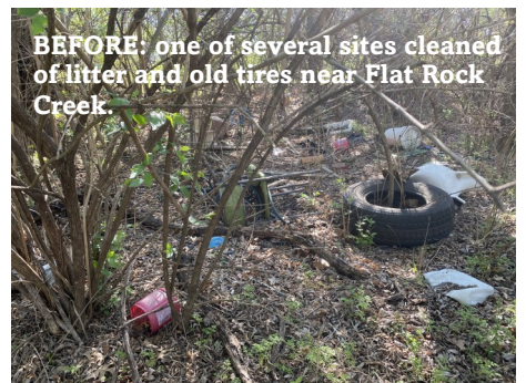
BEFORE: one of several sites cleaned of litter and old tires near Flat Rock Creek.

Up to 200 hundred people learned about efforts in the Crow Creek Watershed at SpringFest, and nearly 250 tires were taken to recycling after they had polluted the woodland by Flat Rock Creek for many years.