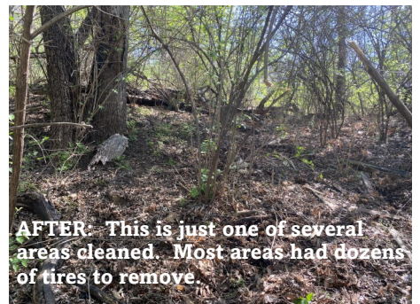
AFTER: This is just one of several areas cleaned. Most areas had dozens of tires to remove.

Rogers State University students (Claremore) dived into Cat Creek to study the creatures who live there with Blue Thumb staff.