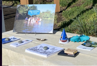
Blue Thumb 30th Anniversary exhibit