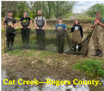
Cat Creek—Rogers County.