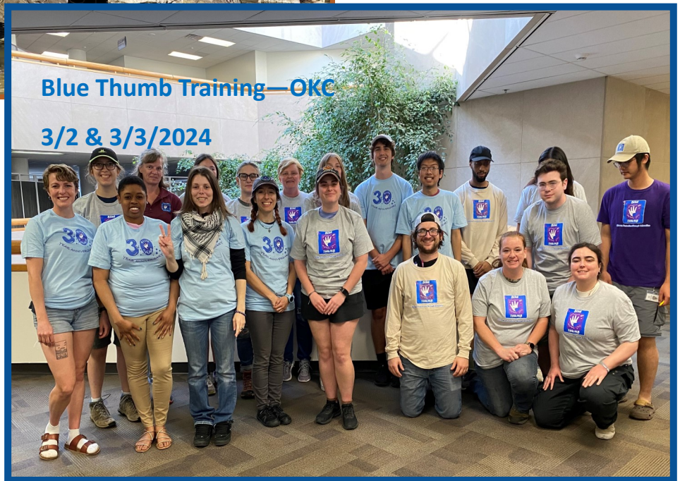
Blue Thumb Training—OKC