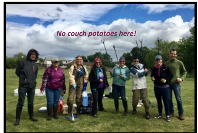
No couch potatoes here!

The Oklahoma School of Innovation and Experiential Learning (OSIEL) students brought demonstrations and computer activities to every Bixby North 2nd grade class last spring. The younger students learned about protecting streams and rivers and conserving water. OSIEL students monitor Fry Ditch in Tulsa County.