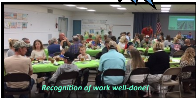
Recognition of work well-done!

Six Districts will get grants this year!