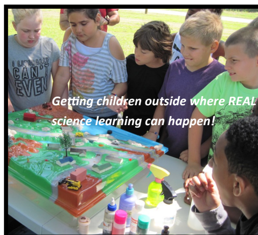
Getting children outside where REAL science learning can happen!

The Logan County Conservation District used FBT funding to help them hold a youth speech, essay, and poster contest across their entire district (Spring 2017).