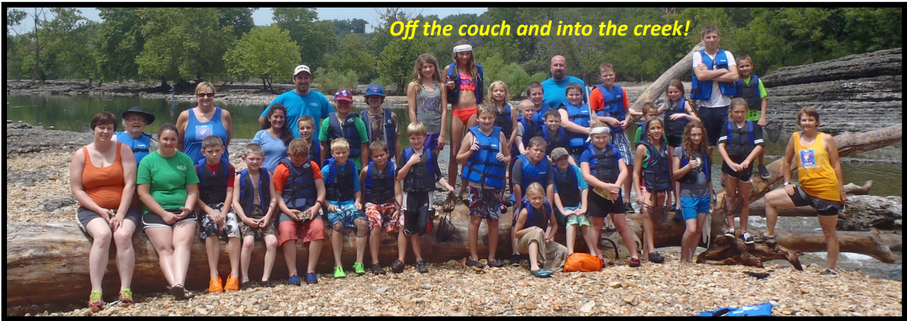
Friends of Blue Thumb was excited to be one of several partners that made the first “A Grand Adventure” water quality youth day camp in NE Oklahoma a great success!

Oklahoma’s streams and rivers do much more than simply move water. Their health is essential to a vibrant fish population, safe and fun recreational areas, and travel corridors for wildlife. These waterways also become our drinking water. The Blue Thumb Program and its volunteers not only ensure the quality of Oklahoma’s streams but they also champion the public to become stream stewards. Please help us protect our streams and rivers by joining Friends of Blue Thumb or making a tax deductible donation. Your support will allow FBT to continue offering funds that make a difference all across Oklahoma!