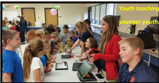
Youth teaching younger youth.

To better understand Friends of Blue Thumb, look below at some of the projects we have supported!